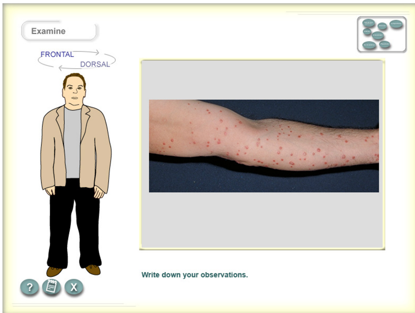
Figure 2 The skin of a patient can be examined by clicking on a cartoon that can be rotated. Images can be magnified. The text is in Swedish in the program.