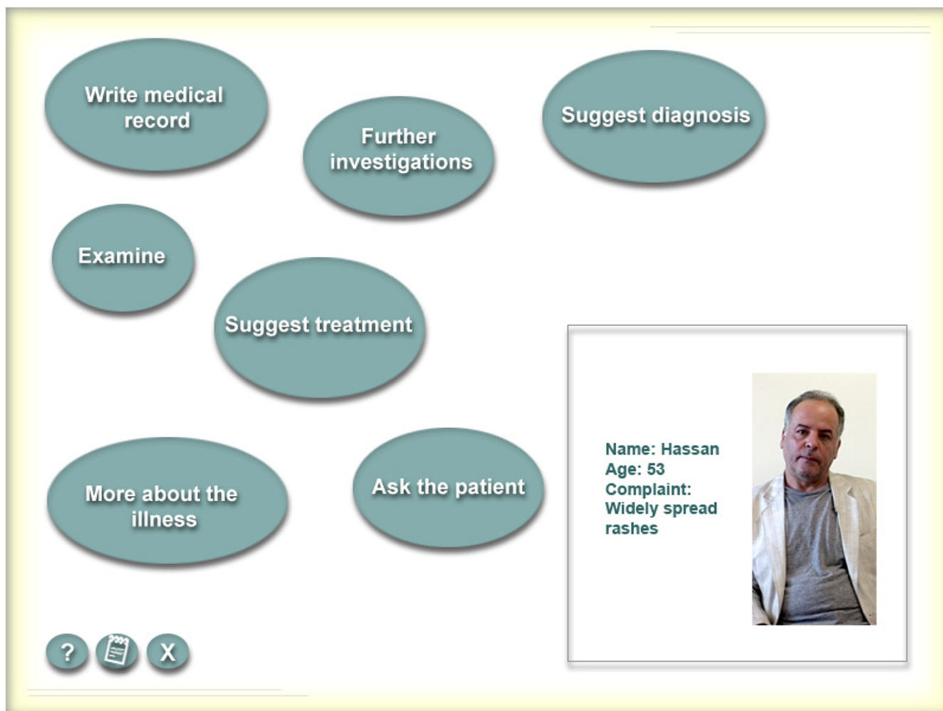
Figure 1 User's options (menu) for the management of a patient. The text is in Swedish in the program.

nitive instances of typical cases, "illness scripts", and rely on contextual factors in developing and using these [10]. Taking this into account, the case presentations were developed with rich contextual facts for each patient. Another reason to keep contextual factors in the patient presentation is to minimise the risk of depersonalising the students' conception of the case [11]. Students can now anchor the diagnosis to an authentic person. We expect the self-directed usage, the rich presentations and authenticity to support a meaning-oriented approach to learning, which has proven to correlate well with study success for advanced medical students [12].